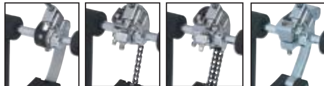
Strap Drive Single Chain Drive Double Chain Drive Direct Drive