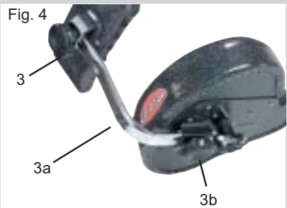
Optional Backrest Assembly