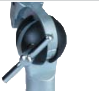
Ultra Adjust Ball