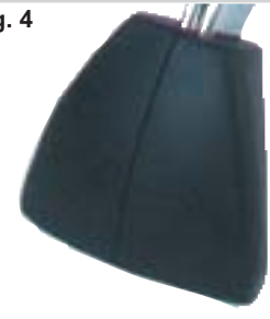
Clydsdale Rubber Foot