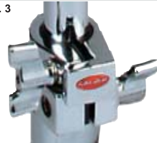
Hinged Memory lock