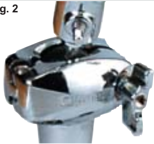
Pivot Style Ball