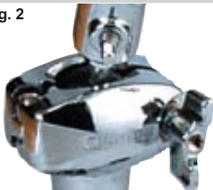
Pivot Style Ball