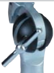
Ultra Adjust Ball